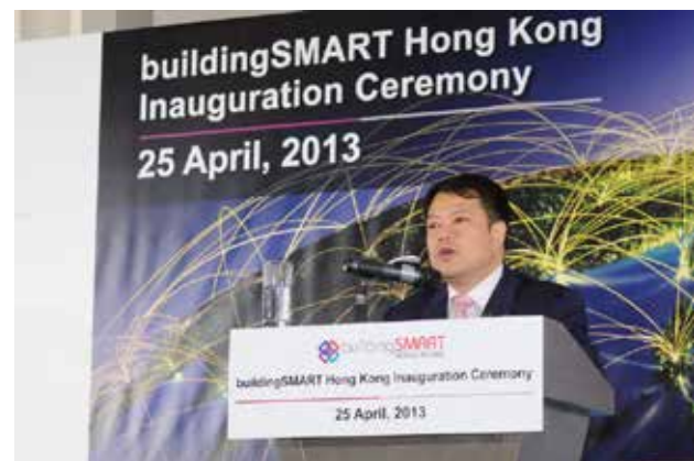
New chapters launch in Beijing (top) and Hong Kong (below)